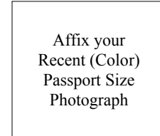
2 nd Applicant