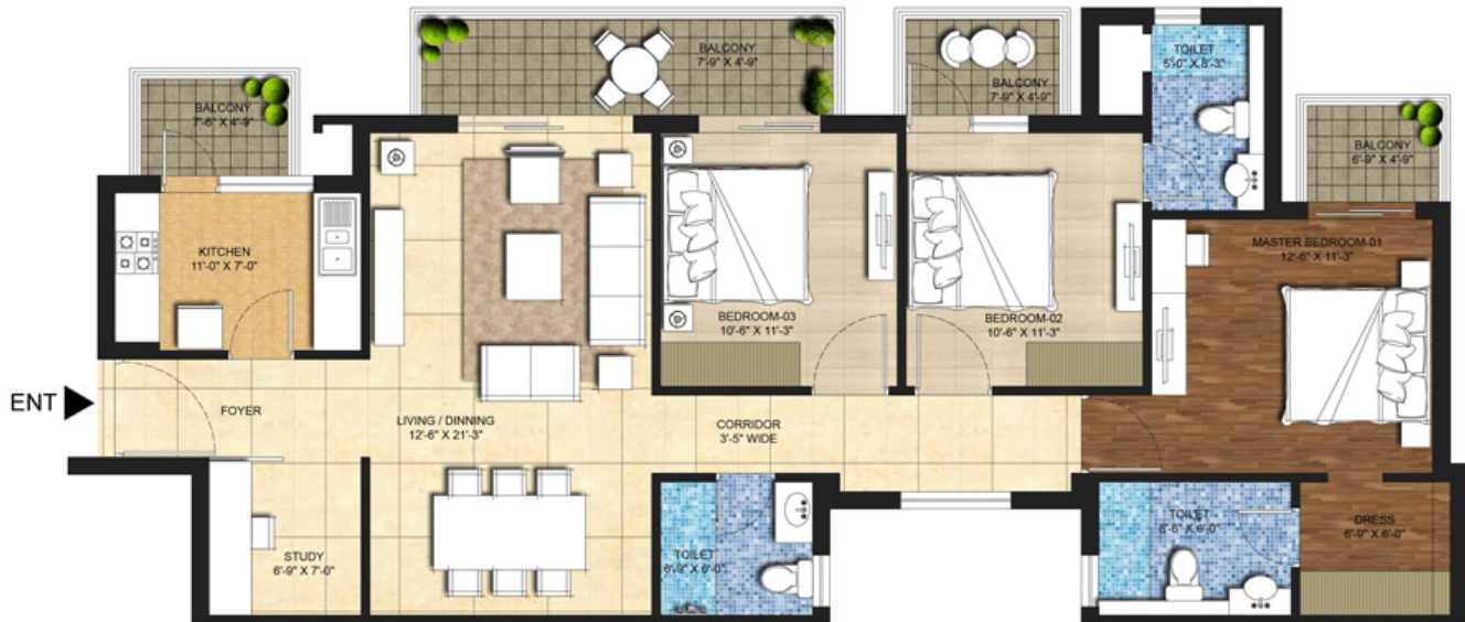
TOWER-J1 & J2 (PH-I)